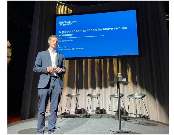
Chatham House panel - A global roadmap for an inclusive circular economy