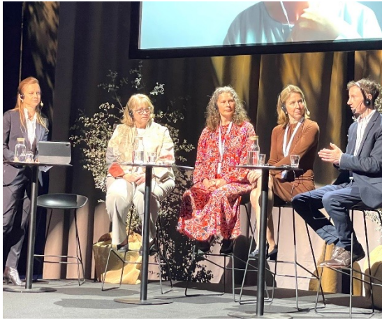
WBCSD panel - Trade Facilitation for the Circular Economy