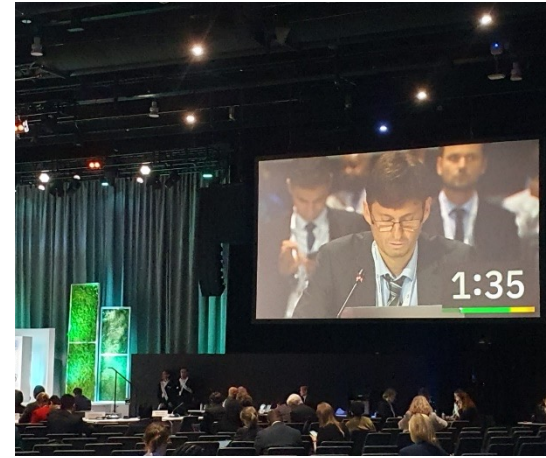
Leadership Dialogue 2 – Stakeholder plenary interventions