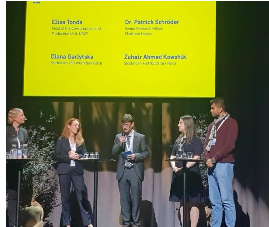
Business Sweden panel - Pioneer the Possible – from Stockholm to Sharm el-Sheikh and beyond