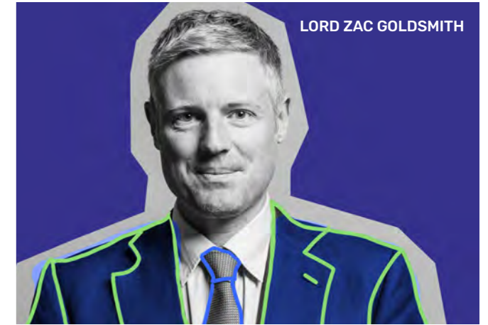
LORD ZAC GOLDSMITH

GLOBAL SOUTH CO CHAIR OF THE COP26 CIVIL SOCIETY AND YOUTH ADVISORY COUNCIL AND THE FOUNDER OF THE GREEN GENERATIONAL INITIATIVE